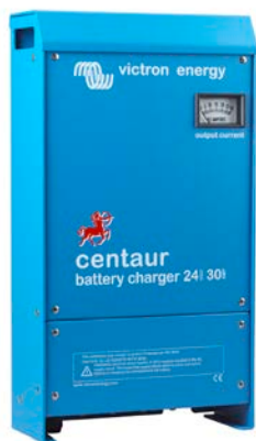
Centaur Battery Charger 24/30