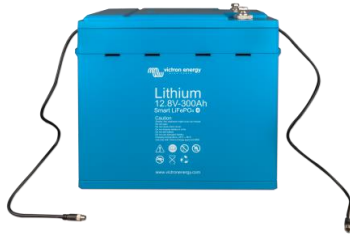
12,8V 300Ah LiFePO4 Battery

LFP batteries are expensive when compared to lead-acid. But in demanding applications, the high initial