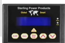
Fig 3.3 PCUR